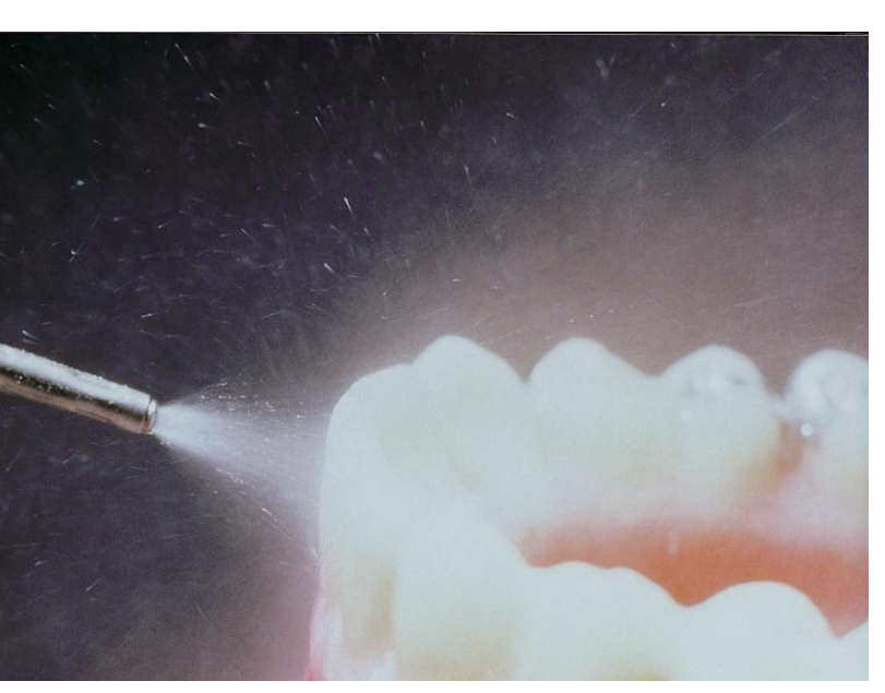
Figure 2. The visible aerosol cloud, made up of water and abrasive at the levels recommended by the manufacturer, produced by an air polisher.

was based on the assumption that all patients may have an infectious bloodborne infection, such as with hepatitis B virus, hepatitis C virus and HIV. It also should be assumed that all patients may have an infectious disease that has the potential to be spread by dental aerosols; thus, universal precautions to limit aerosols also should be in place.