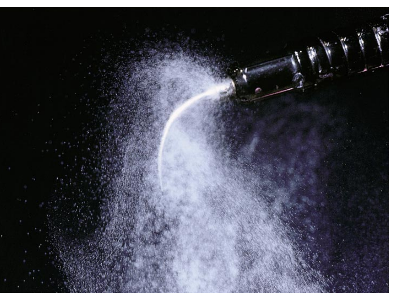
Figure 1. The visible aerosol cloud produced by an ultrasonic scaler using a flow of 17 milliliters per minute of coolant water.